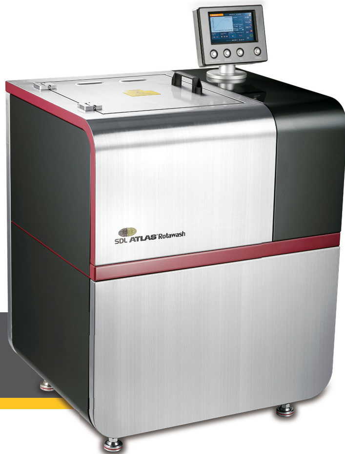
8 Container Model

For determining colorfastness to washing or dry cleaning to ISO, BSI, and AATCC standards for smaller capacities