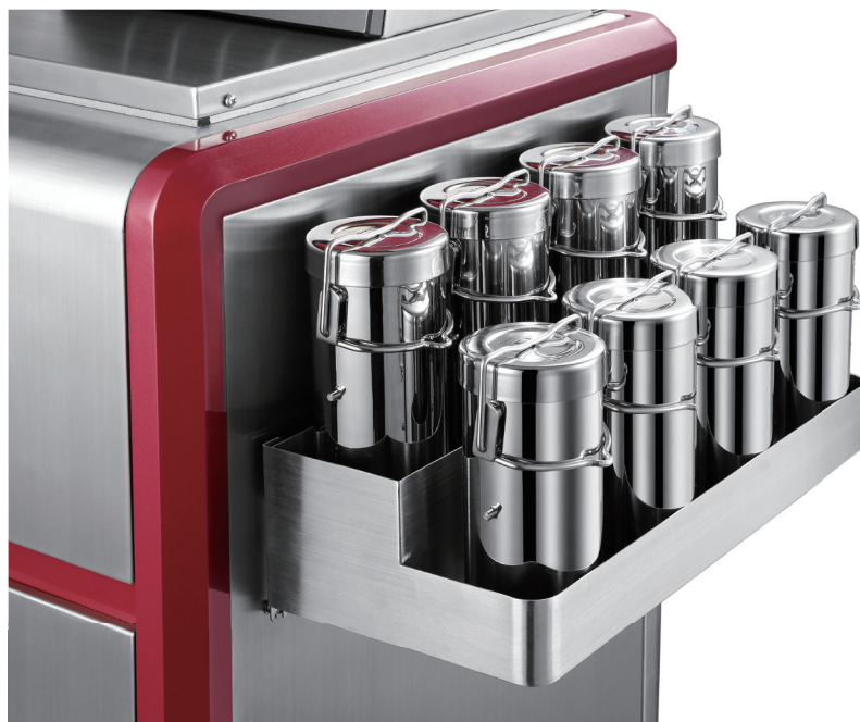
Optional Side Mounted Container Holder

Red flash lighting and beep to alert the end of the test.